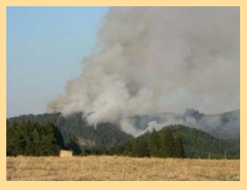
Fig. 2a,b The forest fire lasted one week and it burned vast majority of the organic soil horizons on area of 17.9 ha.

Hg ug.kg 200 300 400 500 600 700 -1.0 -60 UNBURNED BURNED 100 200 300 400 500 600 Hg ug.kg